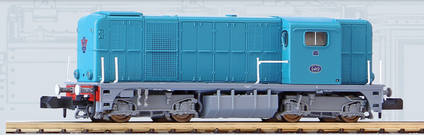
40420 Diesel Locomotive Rh 2400 NS III 40421 Diesel Locomotive Sound Rh 2400 NS III

In the 1950s the Dutch federal railway company (Nederlandse Spoorwegen or NS) decided to replace steam locomotives until the year 1958. The diesel electric locomotives of the series 2400 and 2200 are prime examples for this times of change. The locos of the series Rh 2400 were built by the French company Alsthom and were based on proven constructions. From 1954, 130 of the 80 km/h fast locomotives of the series 2400 were put into operation. Until 1956, the locomotives were painted in a sky-blue colour. Further locos of the series 2400 received a red-brown paintwork and were equipped with large loco plates at the front and smaller ones on the sides of the cabins. From 1971, the vehicles were painted in the grey and yellow colours of the NS. The locos were mainly used for passenger trains in the northern regions of the country and later in some exceptional cases also for feight train service. Some of the locos were stationed in Eindhoven and Amsterdam Watergraafs as well. The locos could be used for multiple-unit train control, so from 1970 you could often see three coupled locos. Some of the series 2400 locos were taken out of service after accidents or breakdowns and between 1982 and 1991 even locos, that were still operational at the time, were scrapped. Between 1990 and 1992, fifty of the locos went to the SNCF for the construction of highspeed routes. There, they were labelled as series 62400 and 62500.