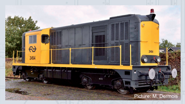
40422 Diesel Locomotive Rh 2400 IV 40423 Diesel Locomotive Sound Rh 2400 IV